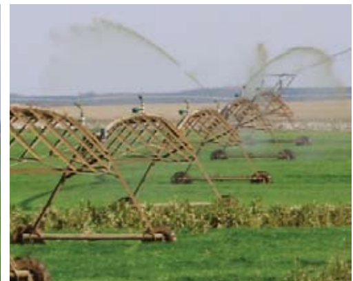
Highbrighton/Barrington Dairies recently faced a challenge of having to avoid applying effluent near a drainage ditch and buffer area. As shown here, the sprinkler guns on the Highbrighton/Barrington pivot turn off as they approach the drainage ditch.