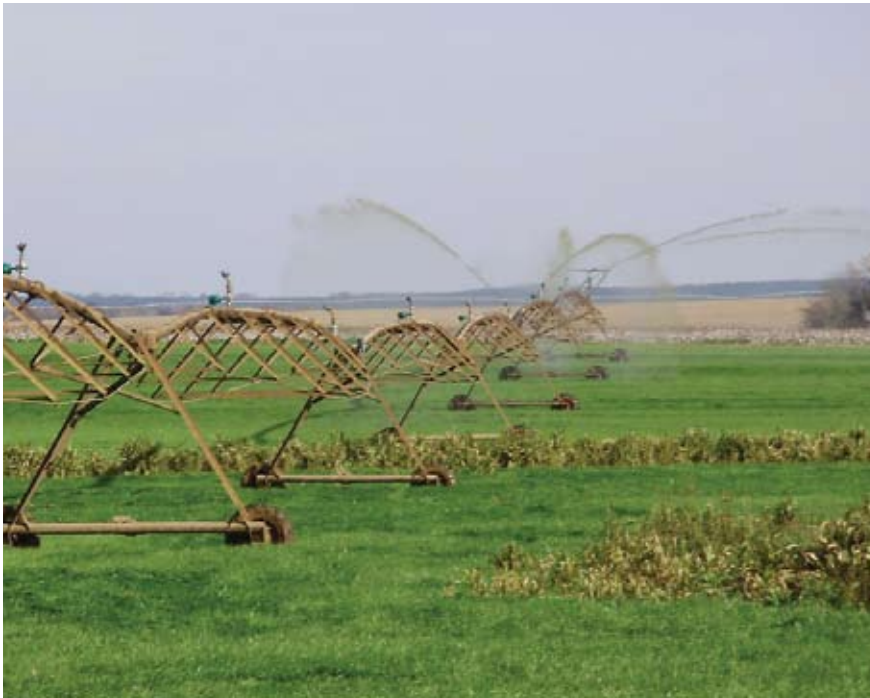
Highbrighton/Barrington Dairy wastewater effluent being applied to the field via Precision VRI – zone control irrigation.

WITH PRECISION VRI – ZONE CONTROL IRRIGATION